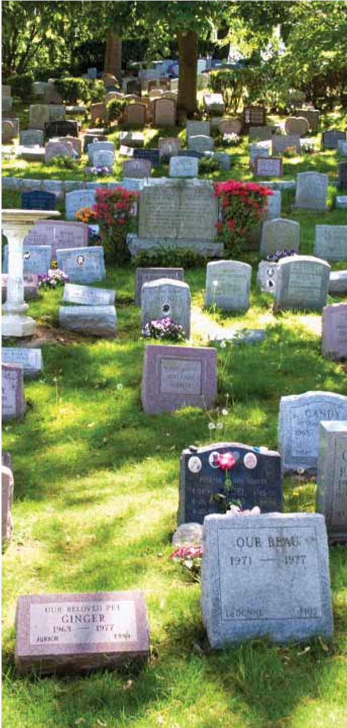
Hartsdale Canine Cemetery