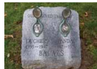
Duchess and Panda