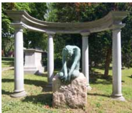
Irene and Vernon Castle

Among others who are buried at Woodlawn and have their pets buried at Hartsdale are Irene Castle (April 17, 1893–January 25, 1969) and Vernon Castle (2 May 1887–15 February 1918). The Castles were a popular dance duo from 1910 until 1918, when Vernon died in a military flight-training exercise. The couple were fashion icons and as well. As a dance team, they introduced a number of dances, such as the Castle Walk, Turkey Trot, Grizzly Bear, and a hands-free version of the Tango. They were also great animal lovers, and a number of their pets are buried around the Castle Monument, including their dog Zowie and her pet monkey, Rastus. After Vernon's death, she became a staunch animal-rights activist, eventually founding the Illinois animal shelter, Orphans of the Storm. Their monument (40 53'26.01"N 73 52'37.67"W) at Woodlawn Cemetery is named "At the End of Day." Near the end of her life, Irene Castle said in a magazine interview, "When I die, my gravestone is to say 'humanitarian' instead of 'dancer.' I put it in my will. Dancing was fun, and I needed the money, but Orphans of the Storm comes from the heart. It's more important."